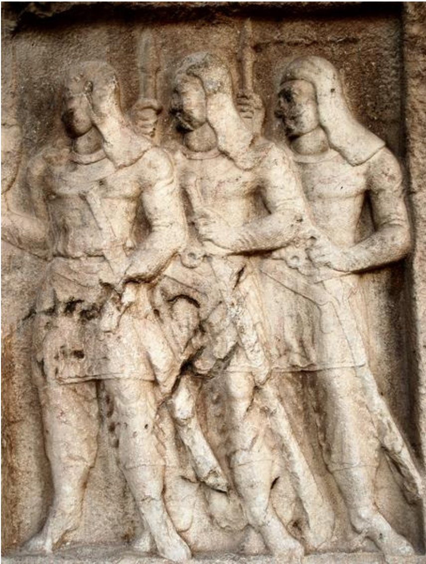
relief at Bishapur.