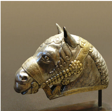
silver gilded from Sassanid finds in Kerman, housed in the Louvre.