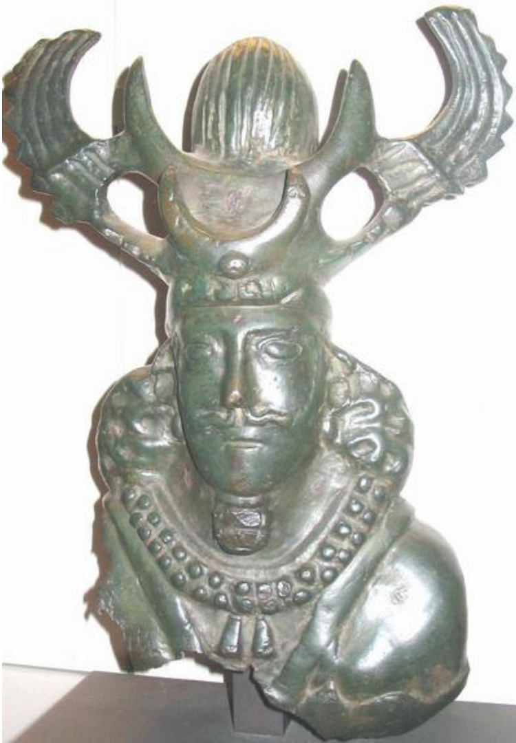
this crown, certainly inspired by animal horns, and antlers, but imposing, probably worn when riding in public and during hunting forays.