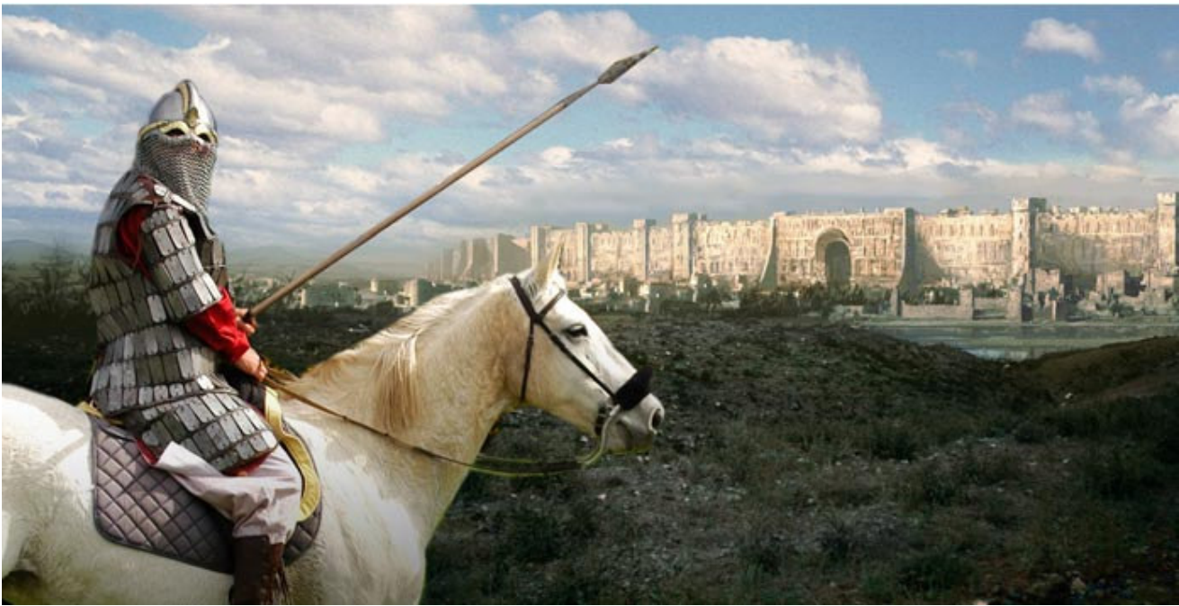
reconstruction of a Sassanid cavalry soldier approaching Ctesiphon, capital of the Sassanids, (Ctesiphon is near modern Baghdad); only the central arch remains, the whole enclosed city and walls were successively destroyed by invading Arabs, and later the Mongols and then Timurlane.