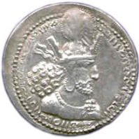
Shapur I (Shahpbur),