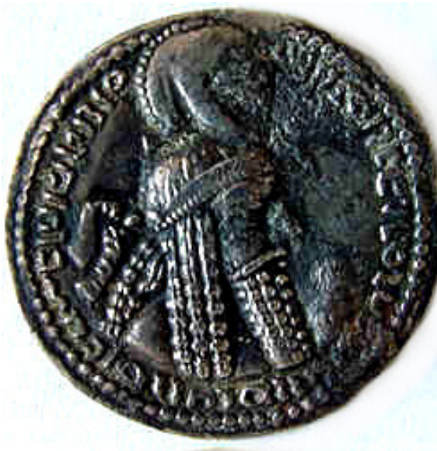
Ardashir I , founder of the Sassanid Empire.