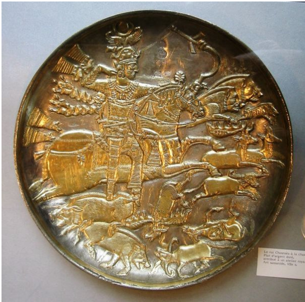
Khusru I (Chosroes) hunting, silver gilded bowl.

In later times, royal hunts were accompanied with a huge retinue of cavalry and elephants, the ladies and courtesans went along living in rich tents and with musicians, female harpists, following!!!