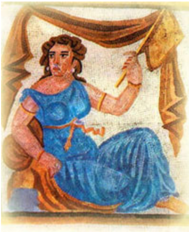
Sassanid lady, in floor mosaic, Bishapoor.