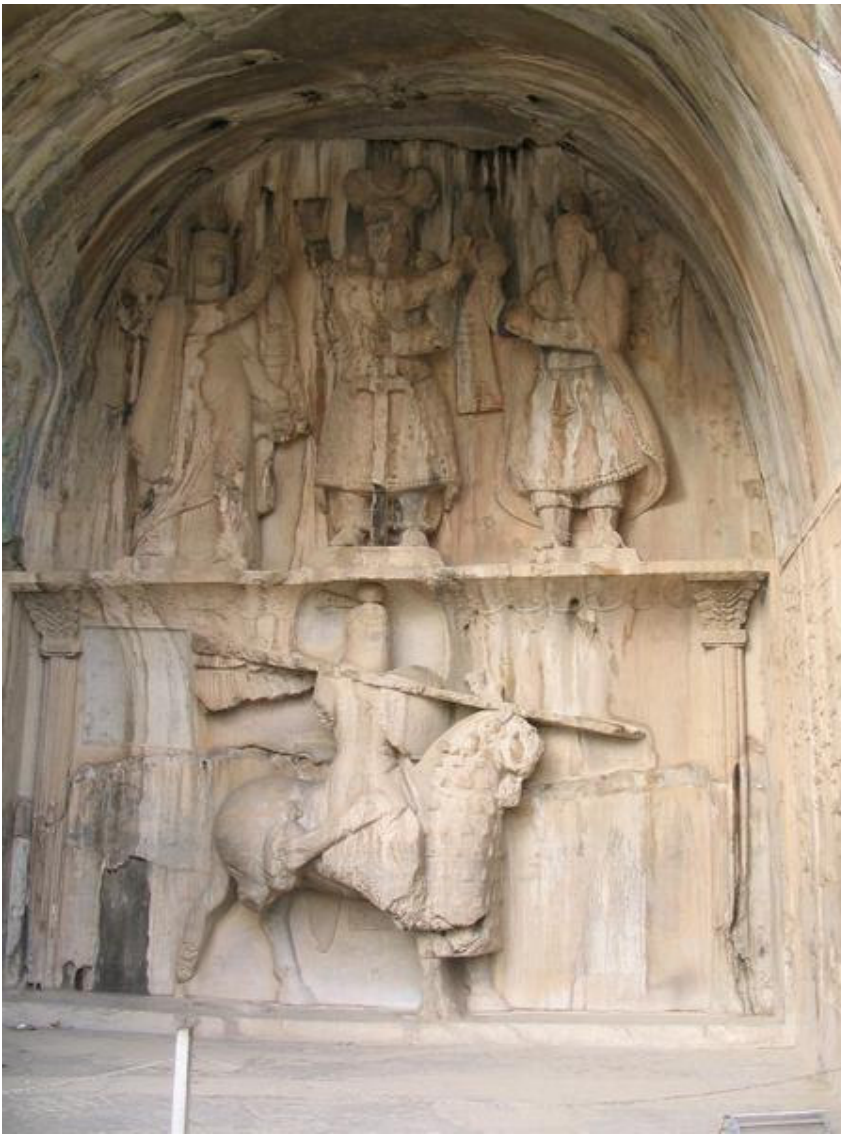
Lower portion of rock relief, a Sassanid "knight" and his horse, clad in full armour.